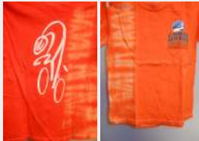
Backside Frontside Event Hillclimb T-Shirt (100% cotton)