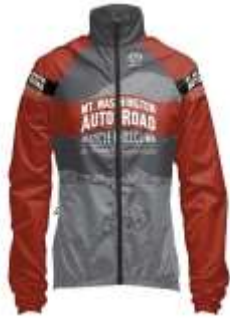
MWARBH Windshell Jacket